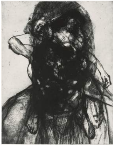
Glenn Brown. Layered Portrait (after Lucian Freud) 9 , 2008. Etching. Sheet: 39 × 31 ½ inches. Printed by Paupers Press, London. Published by Karsten Schubert, London. Edition: 30. Courtesy the artist and Gagosian. © 2020 the artist.