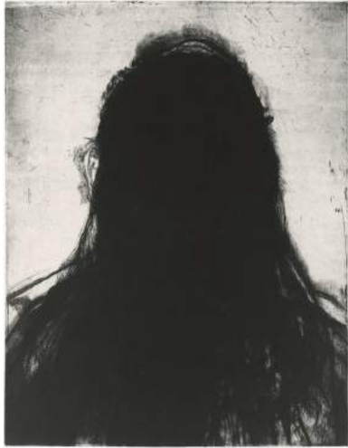
Glenn Brown. Layered Portrait (after Lucian Freud) 5 , 2008. Etching. Sheet: 39 × 31 1/8 inches. Printed by Paupers Press, London. Published by Karsten Schubert, London. Edition: 30.