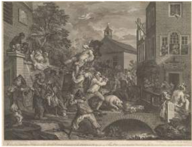
William Hogarth. Chairing the Members, Plate IV: Four Prints of an Election , 1758. Etching and engraving. Sheet: 16 ½ x 22 1/16 inches.