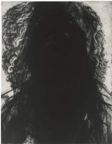
Glenn Brown. Layered Portrait (after Lucian Freud) 2 , 2008. Etching. Sheet: 39 × 31 ⅛ inches. Printed by Paupers Press, London. Published by Karsten Schubert, London. Edition: 30.