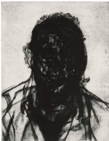
Glenn Brown. Layered Portrait (after Lucian Freud) 6 , 2008. Etching. Sheet: 39 × 31 1/8 inches. Printed by Paupers Press, London. Published by Karsten Schubert, London. Edition: 30.