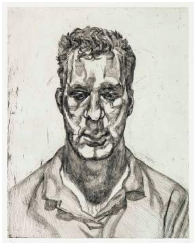
Lucian Freud. Kai , 1991–92. Etching. Plate: 27 × 21 ½ inches. Sheet: 31 × 24 ½ inches. Printed by Studio Prints, London. Published by Matthew Marks Gallery, New York. Edition: 40 + 10 AP.