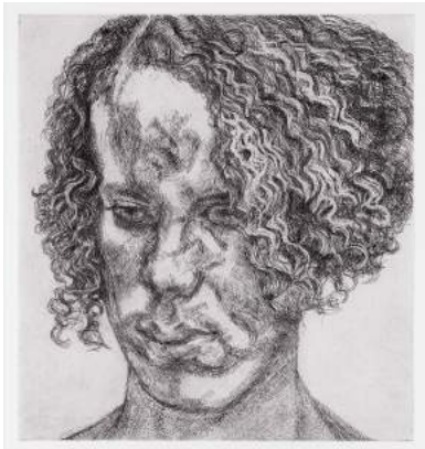
Lucian Freud. Girl with the Fuzzy Hair , 2004. Etching. Plate: 12 × 11 ½ inches. Sheet: 26 × 19 ½ inches. Printed by Studio Prints, London. Published by Acquavella LLC. Edition: 46 + 12 AP.