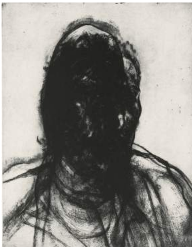
Glenn Brown. Layered Portrait (after Lucian Freud) 7 , 2008. Etching. Sheet: 39 × 31 1/8 inches. Printed by Paupers Press, London. Published by Karsten Schubert, London. Edition: 30.