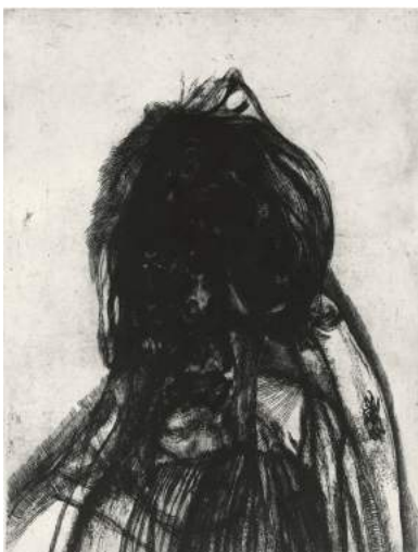
Glenn Brown. Layered Portrait (after Lucian Freud) 4 , 2008. Etching. Sheet: 39 × 31 ⅛ inches. Printed by Paupers Press, London. Published by Karsten Schubert, London. Edition: 30. Courtesy the artist and Gagosian. © 2020 the artist.